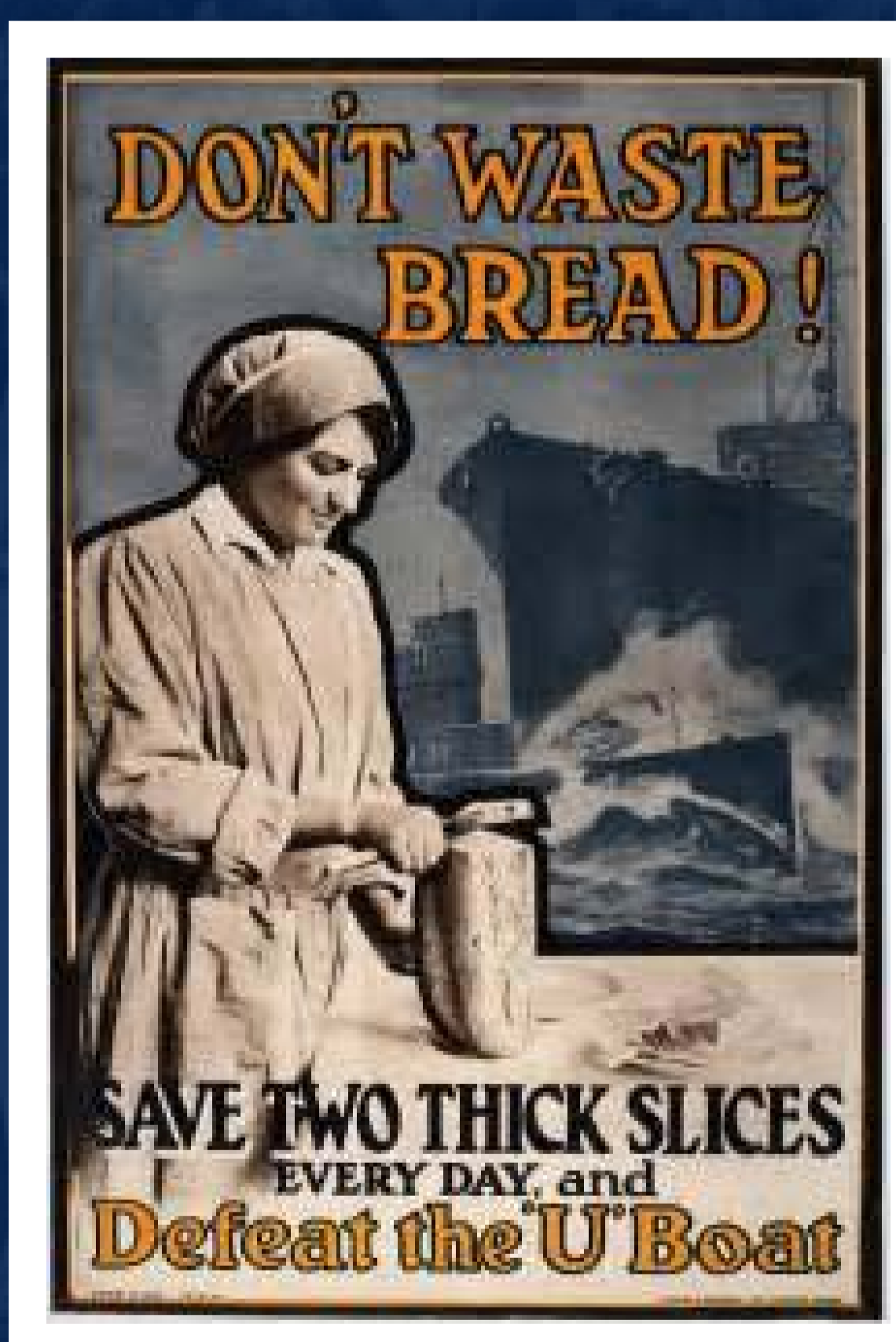
One of the Government's posters to encourage people not to waste food