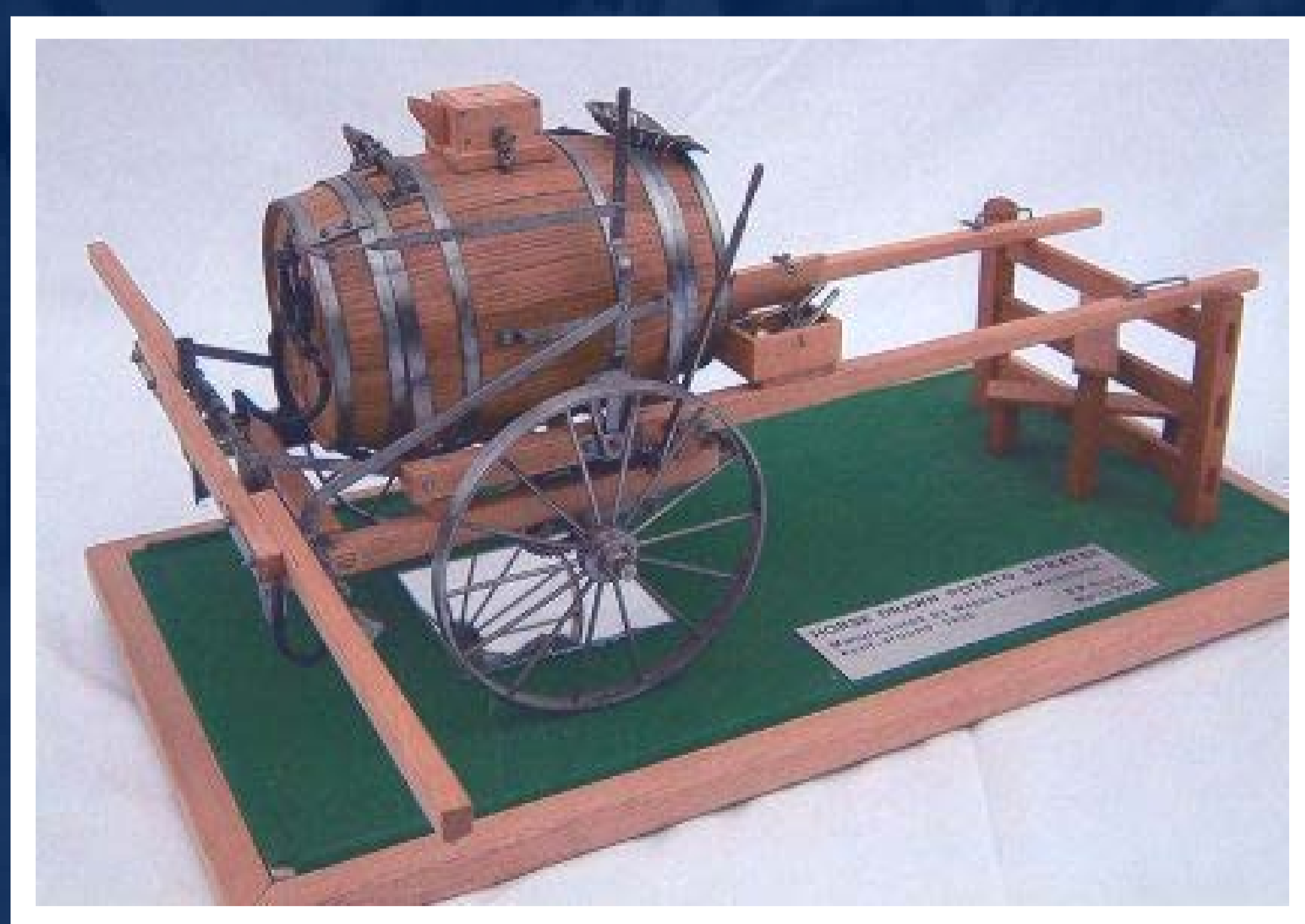
Model of a potato sprayer, similar to that used by Marlow Urban District Council

important local services. A lack of trained men meant that the local water company could not deal quickly with leakages and problems, resulting in an irregular supply of water to the town and frequent complaints from local people.