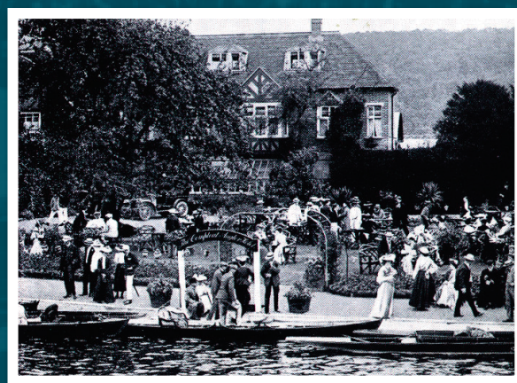
The Compleat Angler before the First World War.