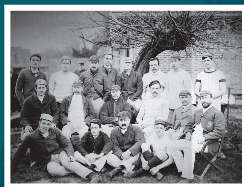
Marlow Rowing Club members c.1890.