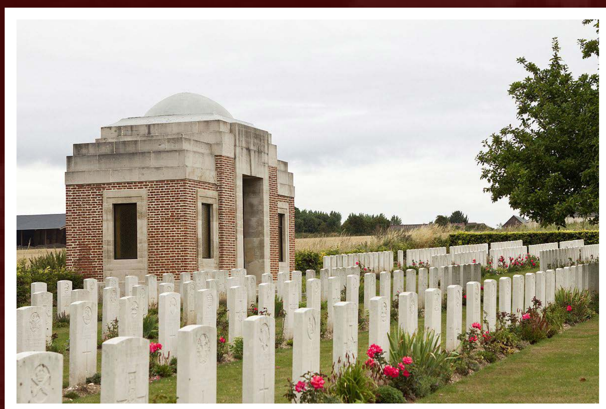
Combes Communal Cemetery Extension, France where Henry is buried.