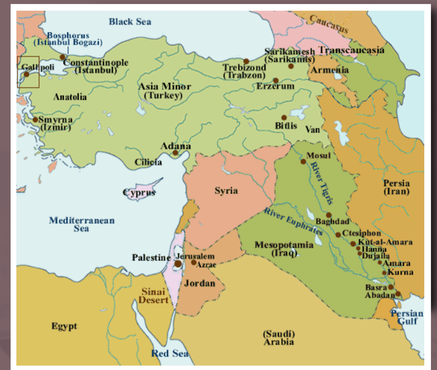
Map of the Mesopotamia campaign

In 1915, Britain decided to push further from Basra into Mesopotamia as part of its plan to knock the Ottoman Empire out of the War. The British got to within 30 miles of their goal of Baghdad, but in November were pushed back and besieged by the Turks in the city of Kut.