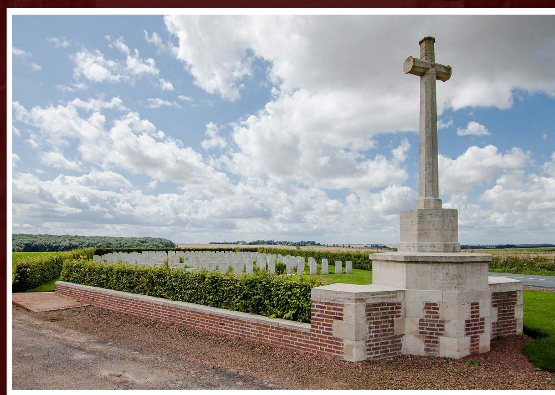
Longueval Road Cemetery, France, where Herbert Lunnon is buried