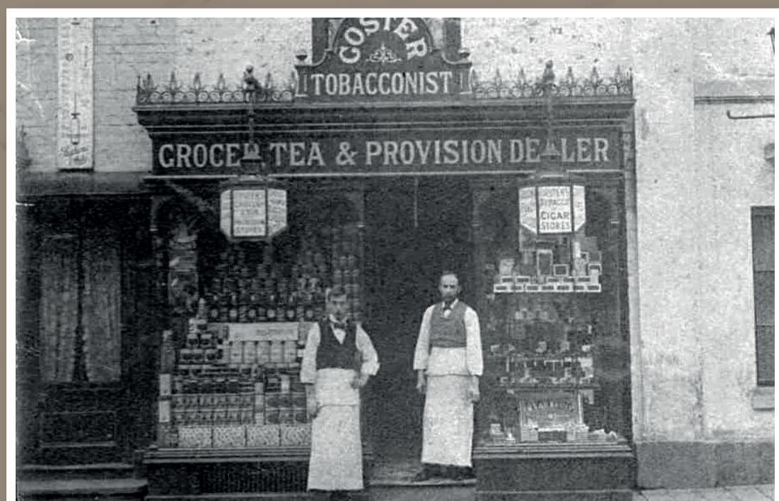
Coster's Grocery Store, High Street, Marlow c1912.