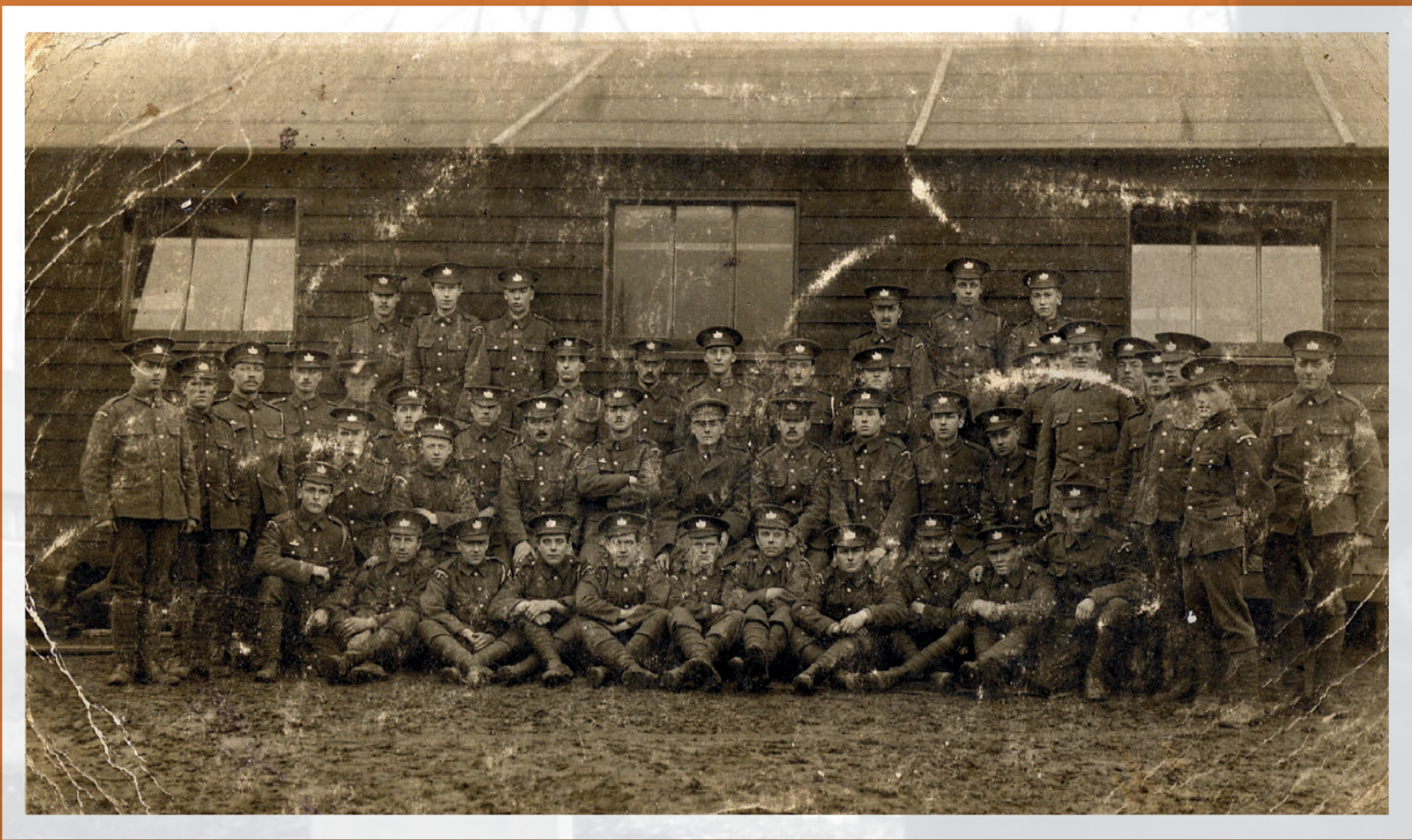
Soldiers of The Gloucestershire Regiment. c. 1914