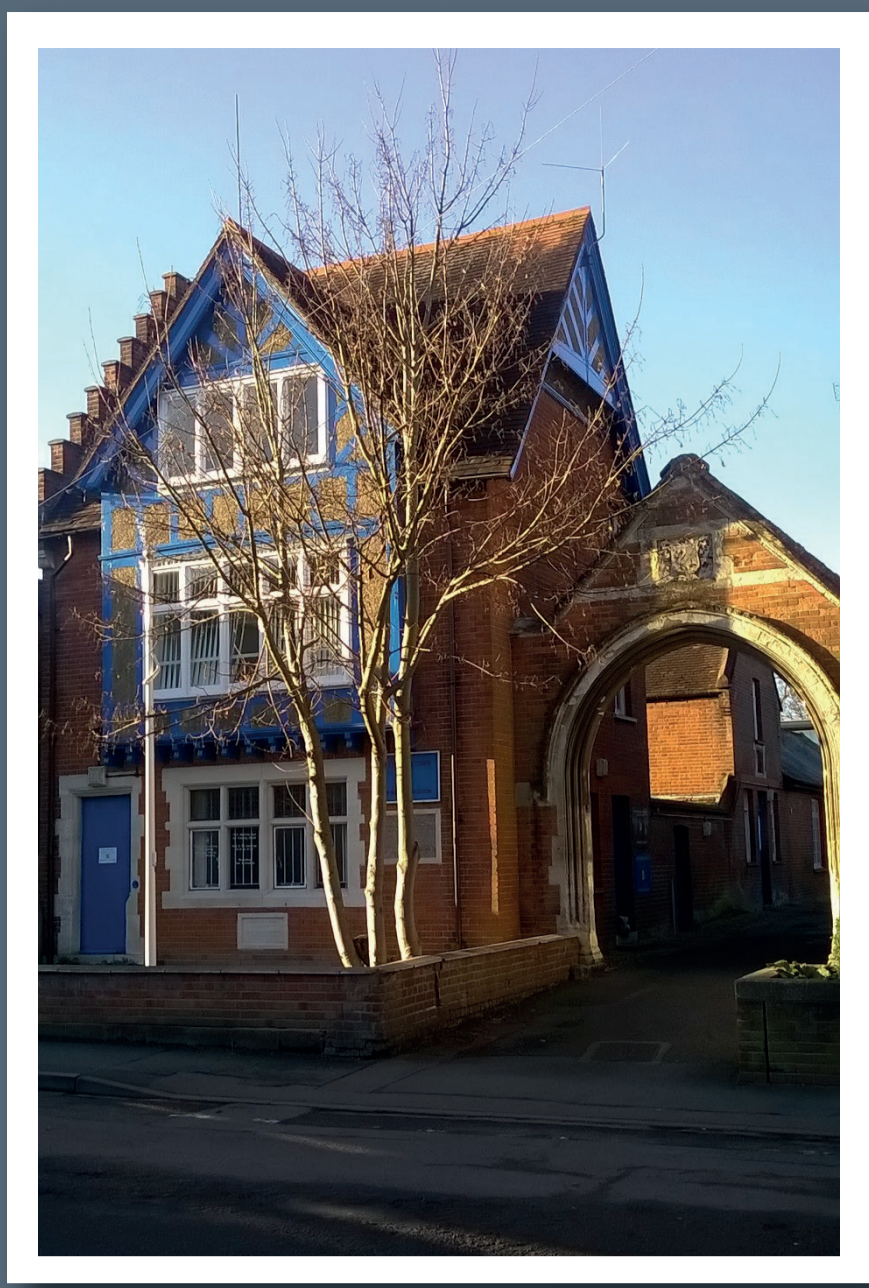
The Armoury, Institute Road