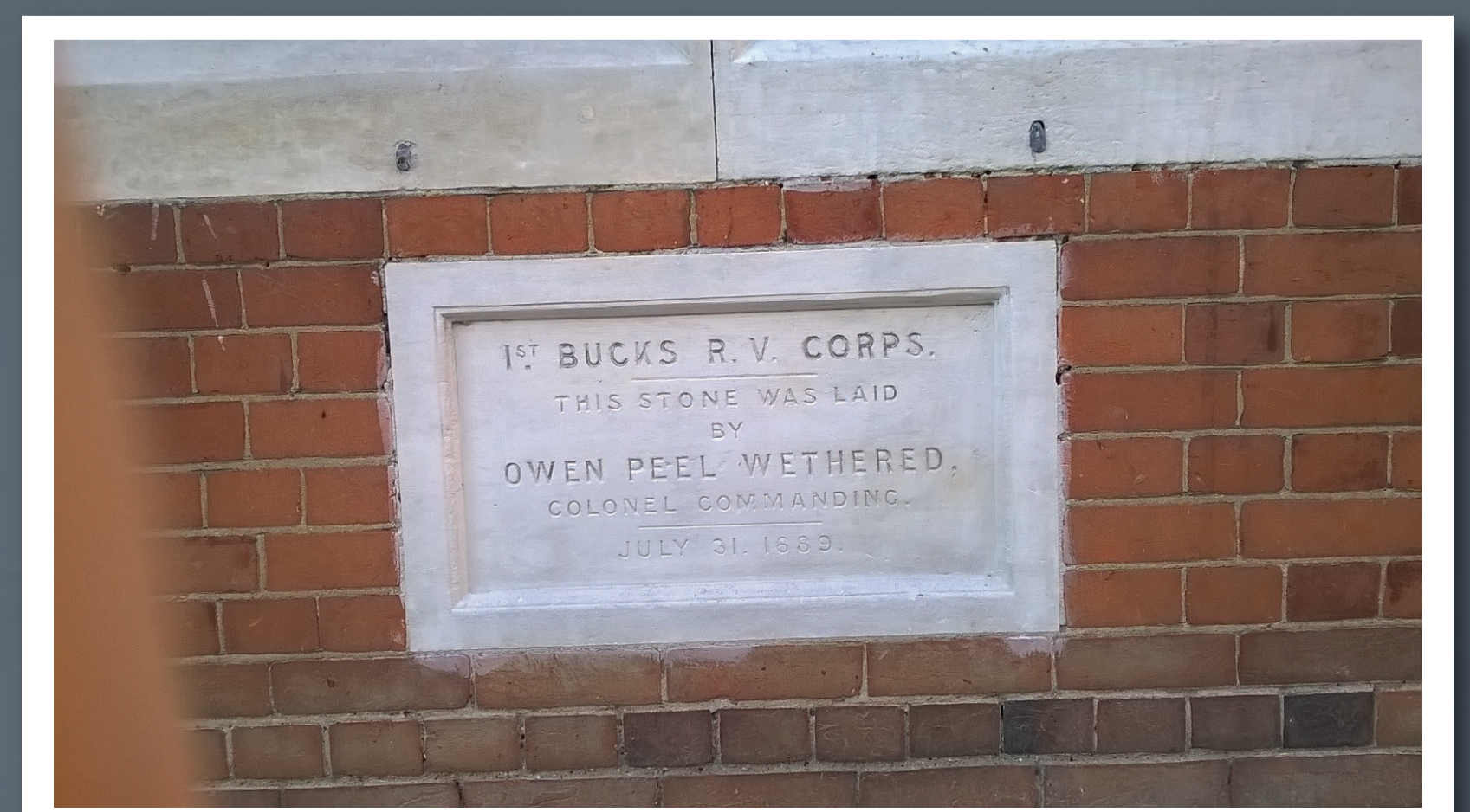
Memorial Stone at the Armoury