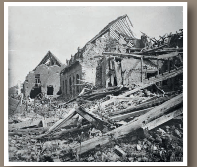
Ruins of Neuve Chapelle after the battle, March 1915.