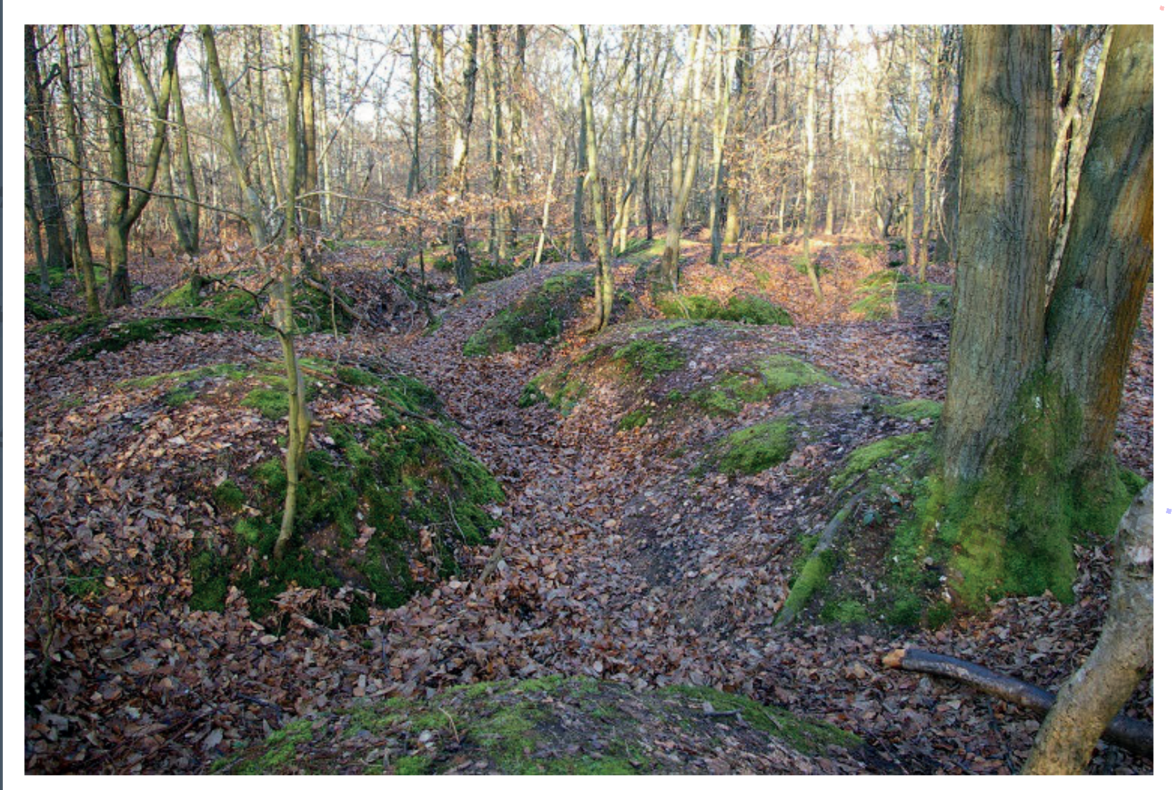
Marlow's Training Trenches Today

The trenches were used for field exercises from June until at least November 1915 by a number of different regiments who were billeted at the nearby Bovington Green Camp. Although the camp was closed in November 1915 after a storm, troops continued to be billeted in and around Marlow until at least March 1916.