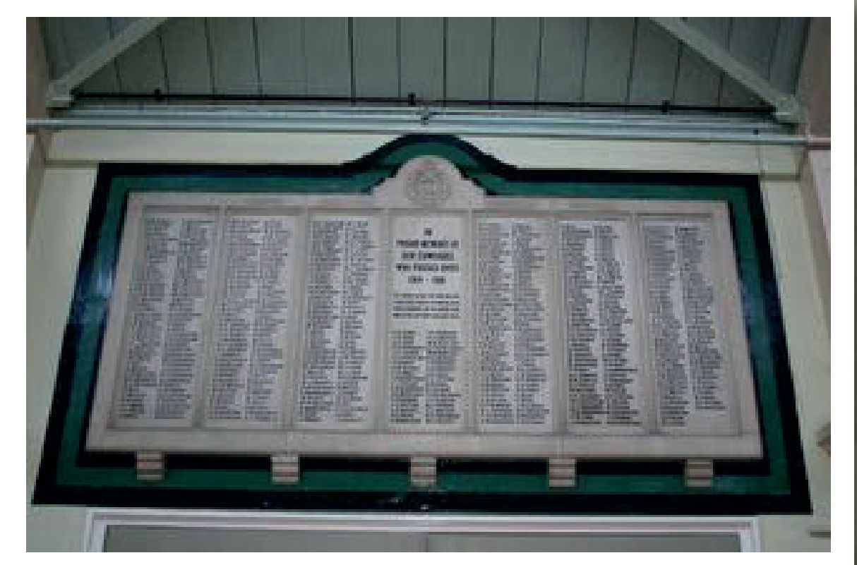
The memorial at the Drill Hall, Newport, Isle of Wight where William North is commemorated