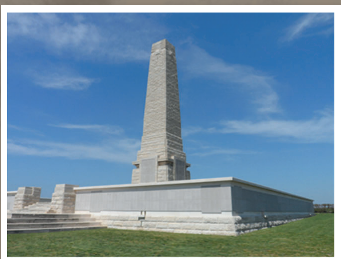
Helles Memorial, Turkey.

All three are remembered on the Helles Memorial in Gallipoli. The Allies eventually withdrew from Gallipoli in early 1916 having failed to achieve their objectives.