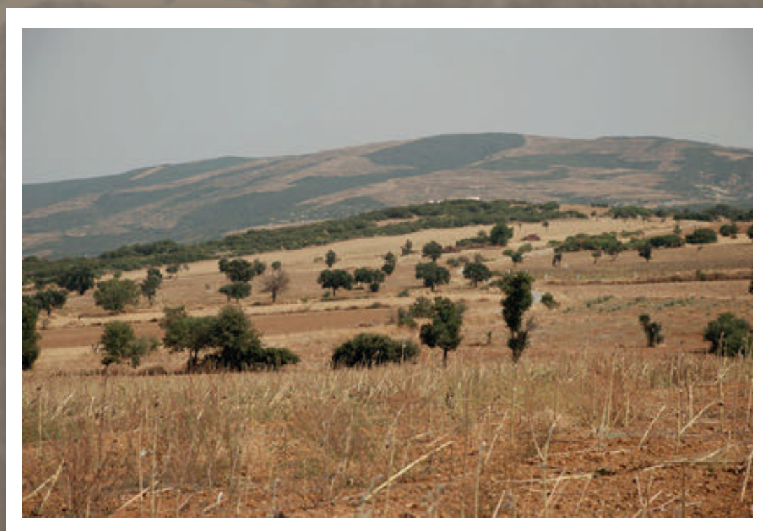
Scimitar Hill today.

The Hussars landed at Gallipoli on 18 August and on 21 August were part of the forces sent to capture nearby Scimitar Hill. While they seemed initially to make good progress in their attack, they were eventually driven back by heavy shell and machine-gun fire. Much of the scrubland over which they crossed had caught fire in the shelling and the soldiers had to bunch together to avoid the fires. This in turn made them easy targets for the Turkish machine-guns. Of the 321 officers and men who started the attack, 140 were killed or wounded.