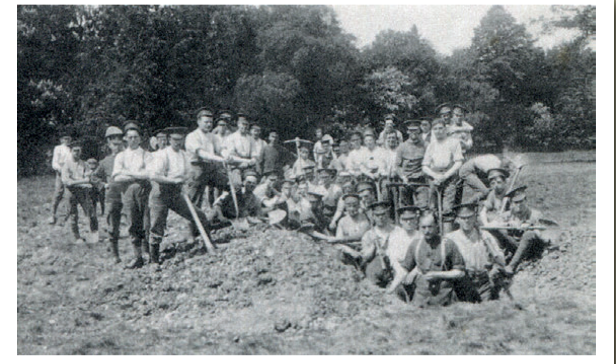
Isle of Wight Rifles training in Watford, summer 1915