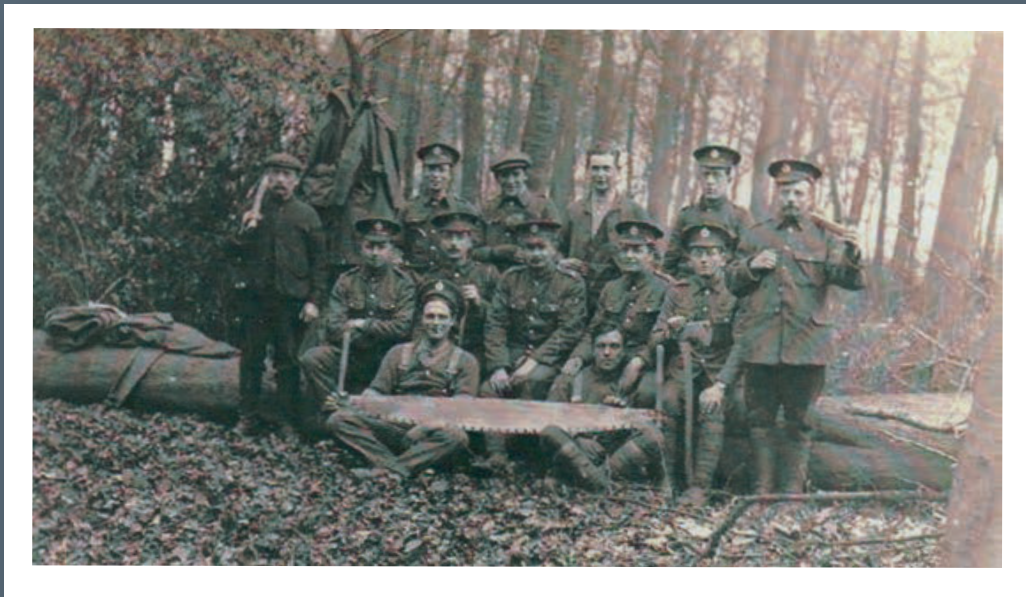
Troops in/near Pullingshill Wood, March 1916