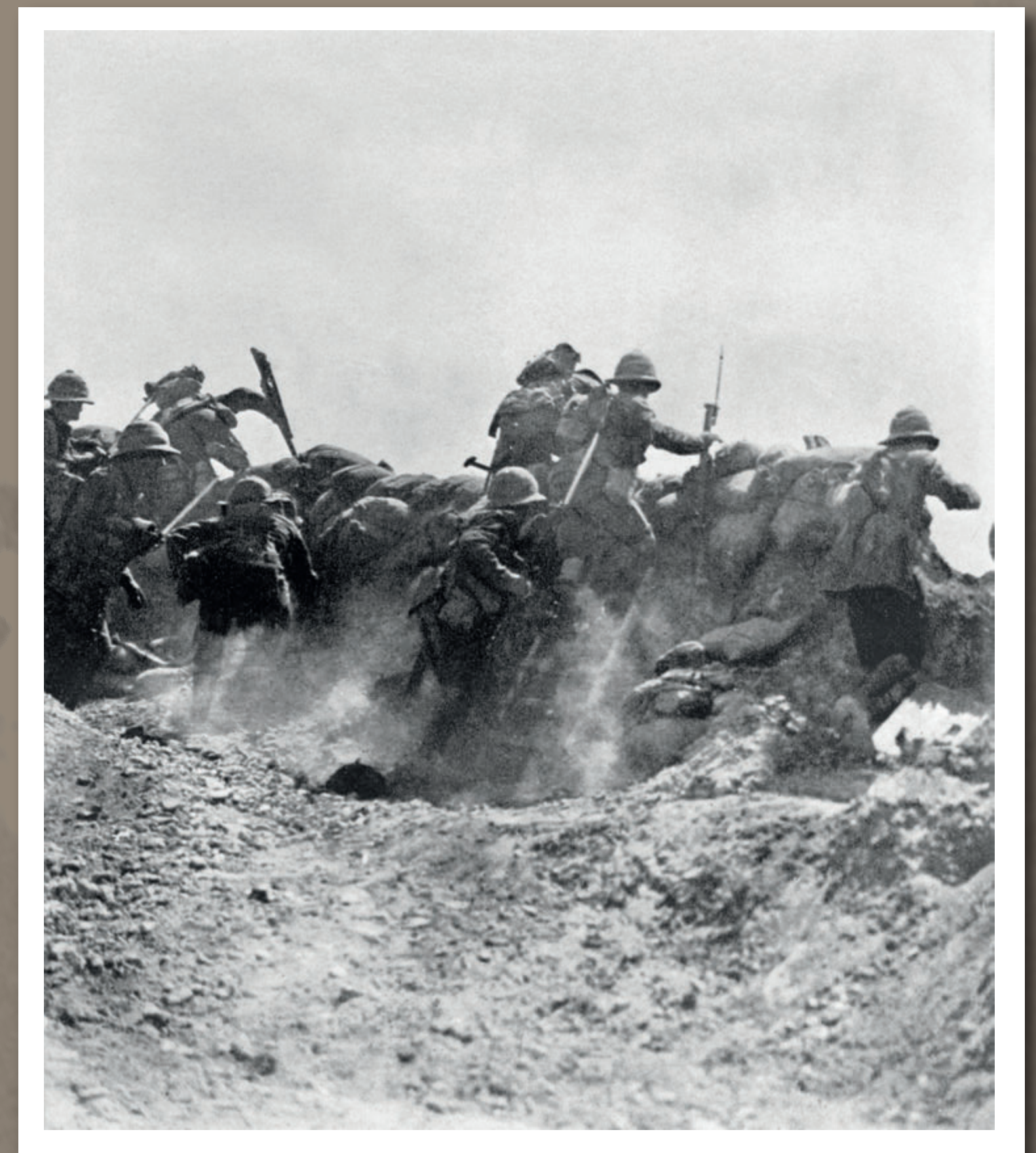
British troops fighting at Gallipoli.

Because the British Army was now severely stretched fighting both in France and Gallipoli, it had to call upon volunteer regiments outside the regular army to provide reinforcements. One of these regiments was the Royal Bucks Hussars, who left England in April 1915 and were first sent to Egypt for training.