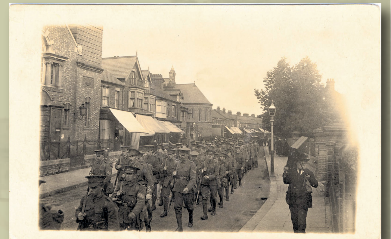
Isle of Wight Rifles marching through Watford, 1915